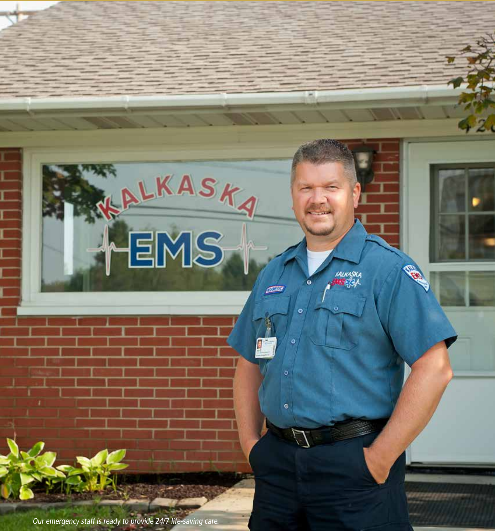
Our emergency staff is ready to provide 24/7 life-saving care.