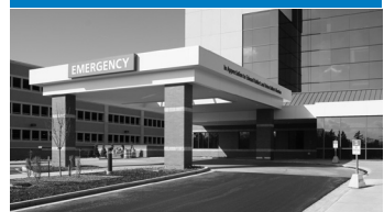
EMERGENCY DEPARTMENT ENTRANCE